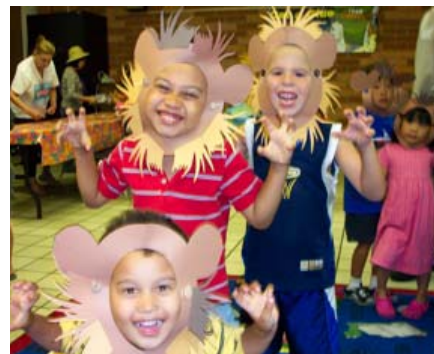
Lions at the Library