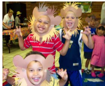
Lions at the Library