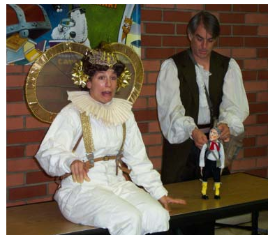
Gulliver Travels to the Library