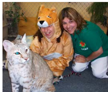
Lion Meets Bobcat at ECO Station