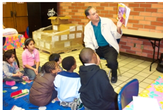
CCFOL President Reads for Presidents' Day