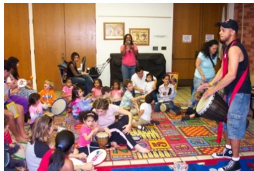
Being not-so-quiet in the library...