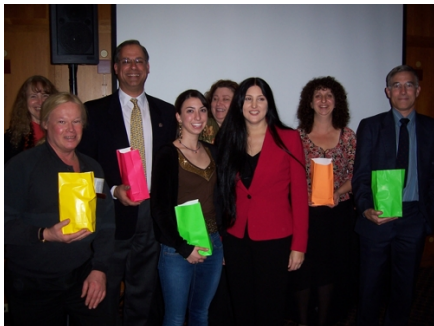
The program began with a silent auction

A capacity crowd attended the Friends' Annual Membership Meeting and Installation Dinner on Tuesday, January 30, 2007, at the Radisson Hotel in Culver City. It was a great event, celebrating a great year! The program highlighted CCFOL's accomplishments in 2006 -- the Friends' most successful year ever -- including the popular and inspiring Culver City Reads 2006 program based upon the classic novel Peter Pan by J. M. Barrie. Throughout the evening, literally thousands of photographs of 2006 Friends of the Library events slowly flashed on a large screen, reminding attendees of all the fun they had in 2006.