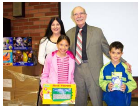
Ant Farm and Uncle Milton!