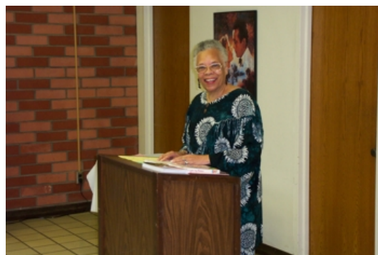
Celebrating Women's History Month