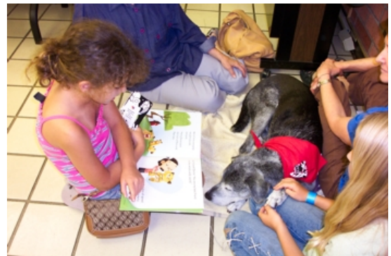
Highlights from the Fourth Quarter of 2007